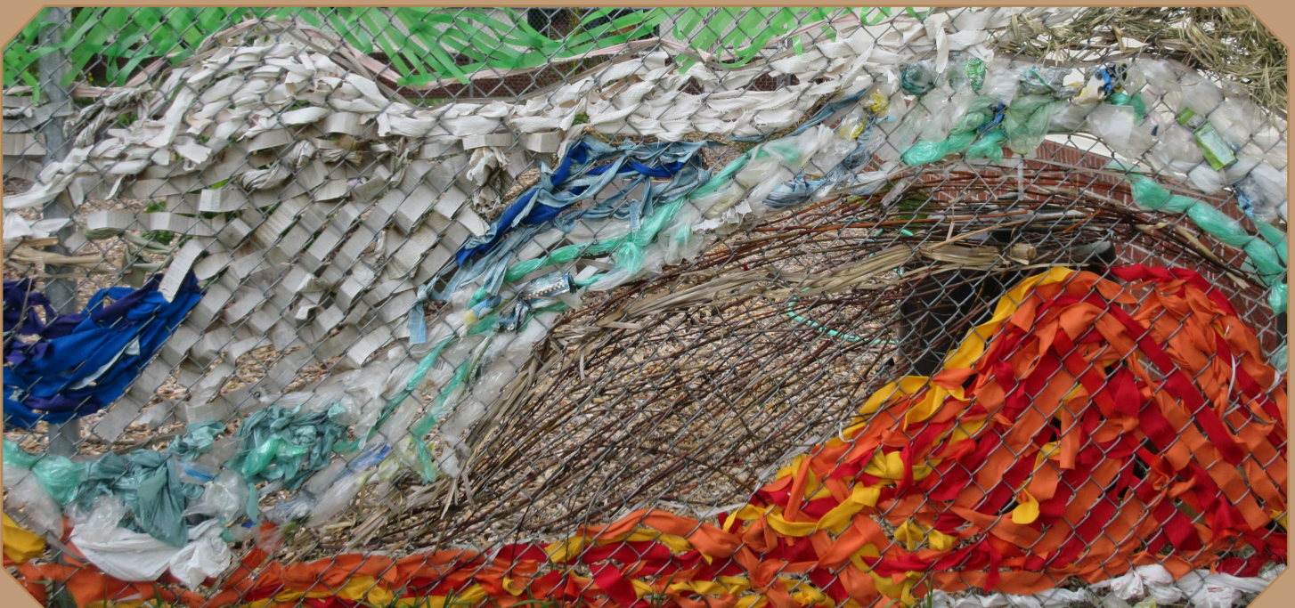
Earth Strata Woven Wall: 2015-2016

Through cohesive engagement in the arts, ArtCore will catalyze and sustain progress in teaching and learning for marginalized educators and students. By nurturing an unshakeable sense of possibility in educators and developing their skills to integrate the arts into other academic areas, new pathways open for students to engage and persist creatively as lifelong learners.